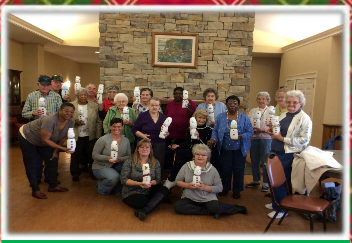
Above: Woodford County Senior Center made snowmen out of socks! Below: Woodford County Senior Center Wreath